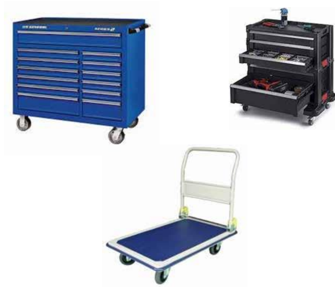
Roller Tool Troly