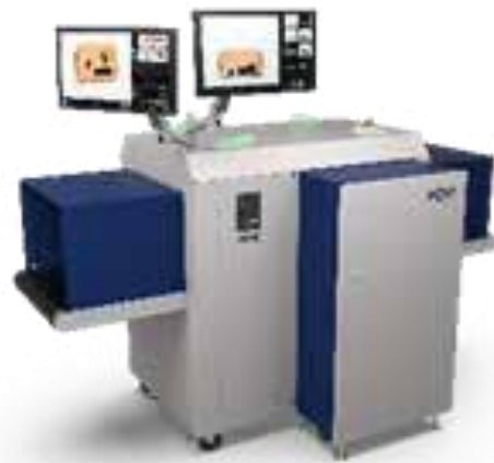
X-ray Baggage Machines