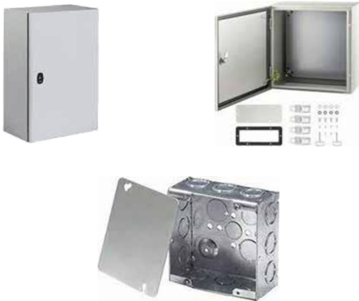
Electrical Boxes & Fittings