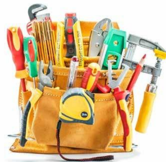
General Tools And Equipment's