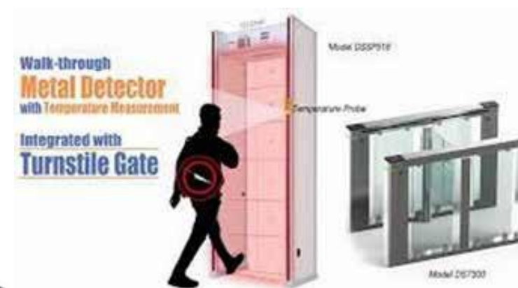
Walk Through Detector And Hand Hail Detector