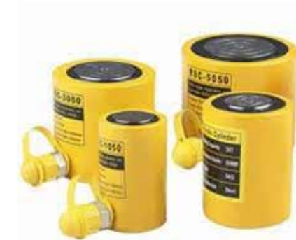
Hydurilac Cylinder And Jacks