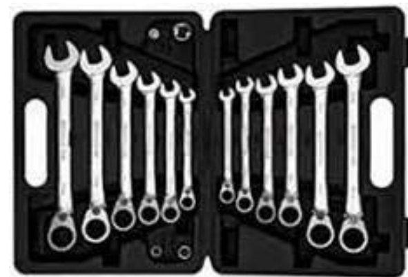
Spanner & Wrenches