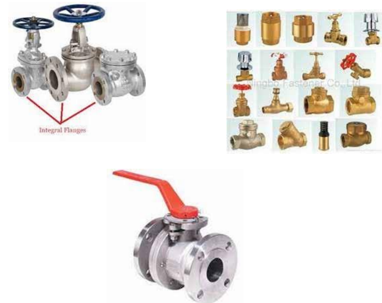
Pipe Flange & Valves