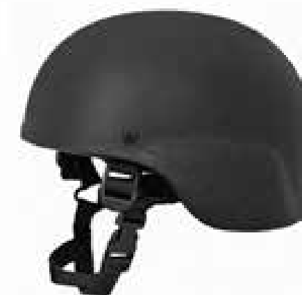
Bullet proof Vest & Helmets